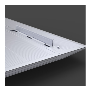
ROLL STOPS, 90 DEGREE

A must if you have loads on wheels. Built in rollstops provide effective protection for both goods and employees.